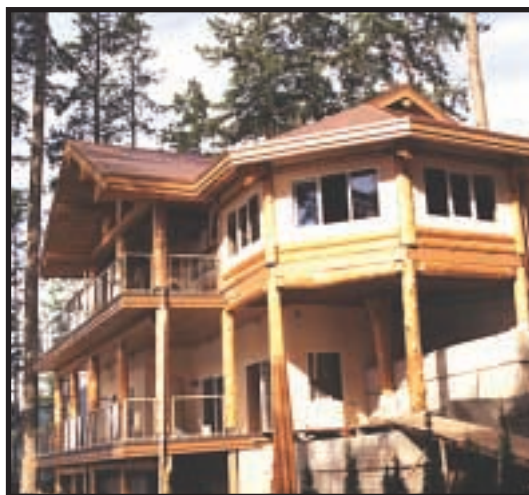
EuroLine Tilt & Turn windows and patio doors frame dramatic ocean views from tri-level balconies with octagon sunroof off the upper deck.