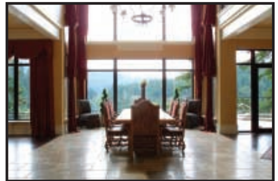
A wall of oversize EuroLine windows provides a dramatic frame to the panoramic view overlooking beautiful Nita Lake

In addition to being chosen for the Chateau du Lac residence, Euroline windows are also featured in Whistler’s Summit Lodge and other prestigious properties throughout British Columbia, Alberta, Manitoba, Washington State, Oregon, California, Idaho, Colorado, Montana, Alaska and the Caribbean.