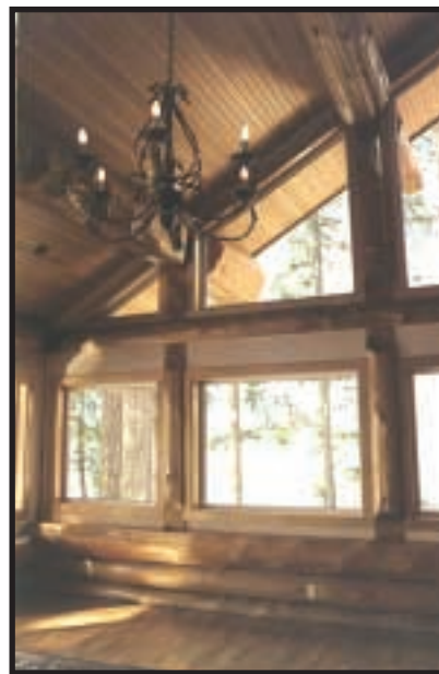
Larger than normal EuroLine windows highlight upstairs living room view in this elegant half post and beam, half traditional log construction home.

The best and nothing but the best – from high quality logs to state-of-the-art windows and patio doors – to first-quality appliances and conveniences, these homes elevate log construction to a whole new league and EuroLine is proud to be part of the total picture.