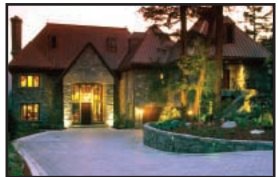
Larger than normal EuroLine windows highlight welcoming entrance to luxurious Whistler Chateau du Lac.