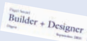
As seen in Builder + Designer September 2001 issue

Allied Construction spokesperson Terry Ford says, "We needed the most flying coconut resistant windows we could find. After considerable investigation we took the advise of our architect and contacted EuroLine who have now supplied us with windows & patio doors for two homes with windows for a third home now in production. In addition to using special glass, and looking great, EuroLine windows and patio doors are steel reinforced and made of a proprietary uPVCplus building material that can take on just about any kind of extreme weather. EuroLine windows and doors are UV resistant, never fade or yellow, and are available with a EuroWood finish that allows us to have a color on the exterior window and door surface and a EuroWood or metal looking finish on the interior – or visa versa".