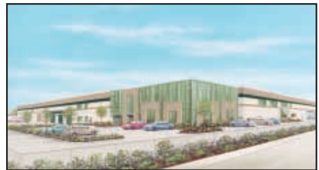
EuroLine's new facility will provide expanded manufacturing capacity.

Manitoba as well as sales offices and showroom facilities in Washington State. Only the Canadian Head Office address will change. Phone, fax, email and web address remain unchanged.