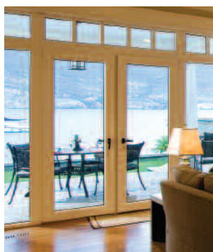
EuroLine French doors stylishly open rooms